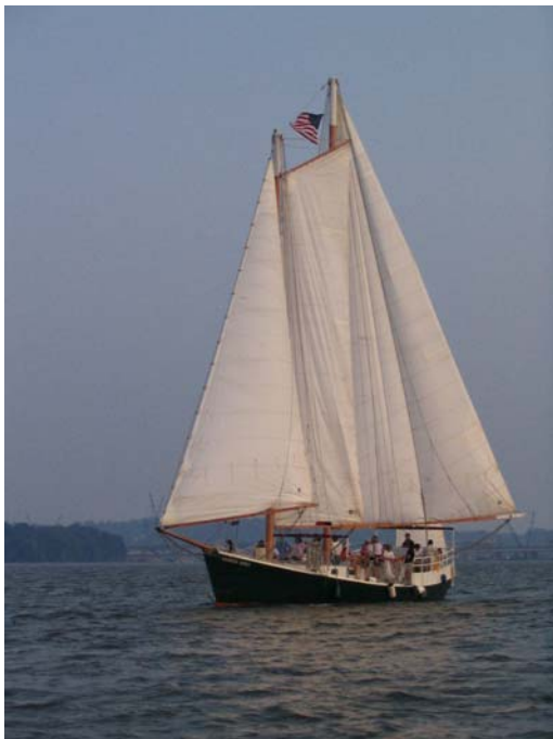
SCOW - Sailing on Marina Day On American Spirit

The coming Fall also reminds us that the Board members terms are coming to an end and we are beginning the process of selecting a new slate for 2006. We need nominations by the October general membership meeting so we can elect a Board in November. You could have another title for your resume if you get elected!!