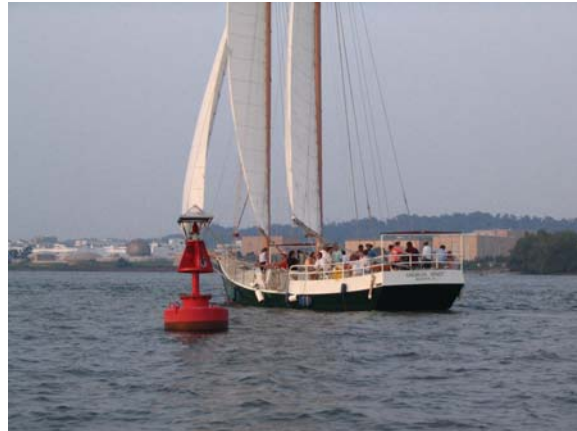
SCOW - Sailing to DC On American Spirit